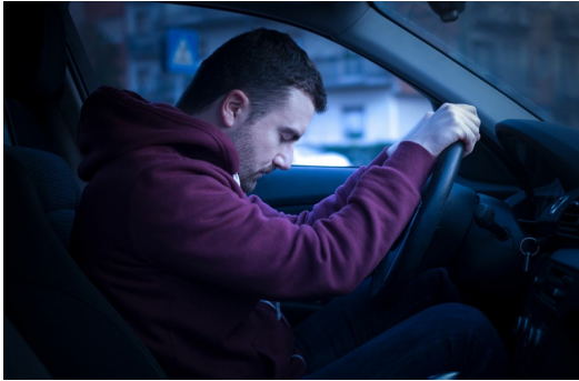
Drowsy driving is a threat to safety.

Suffolk County reportedly has recorded the most car accidents caused by sleepy drivers in the state; Stony Brook University researchers are on a mission to help turn that around.